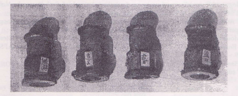
(Sand condition 1) (Sand condition 2) (Sand condition 3) (Sand condition 4) Fig. 14: Bronze (Reducing channel) cast products