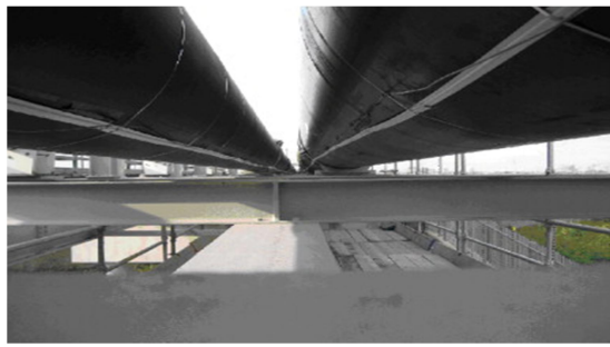
Figure 1: Optical fiber cable laid along a pipeline

The smart system involves installing optical fiber cable and its fiber optics sensory technology along with the pipeline itself (see figure 1).