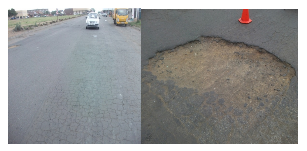
Figure 2 Assessment of the pavement condition