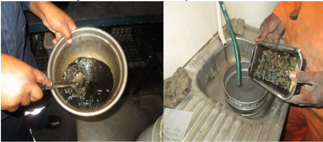
Figure 4 Laboratory evaluations of the recycled pavement materials

Figure 3 Structural Assessment of the pavement section