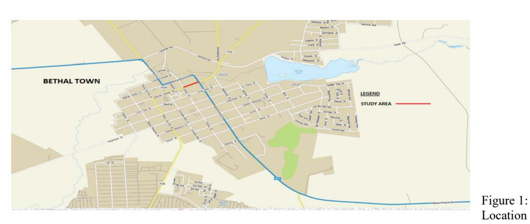
of study area

will be done every 10 years within the analysis period. Future cost was calculated with the assumption that the first resurfacing of 10 mm will be done after 10 years, rehabilitation of base and wearing course will be after 20 years and another reseal after 25 years.