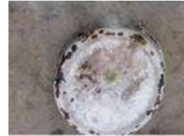
Figure 3.2: Mould used in the production of the pave block.

The diameter was 18.5cm and with thickness 4cm.