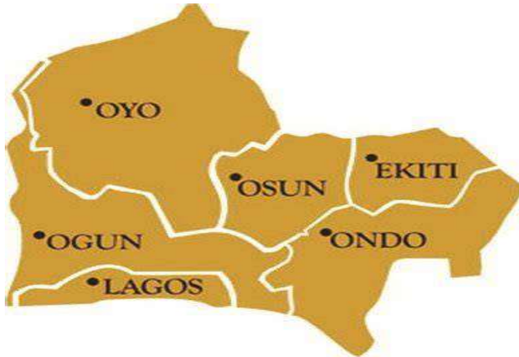
Figure 2: showing map of southwest geopolitical zone in nigeria

Names and number of resort hotel sited in tourist center of south-west geopolitical zone are tabulated below;