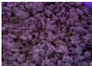
Figure 3: Cocconut cake