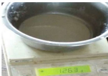
Figure 4: Milk Extracted