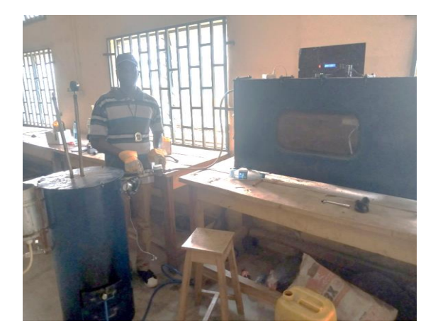
Figure 1: Steam Boiler, Sand Box and Condenser Set-Up for the Experiment