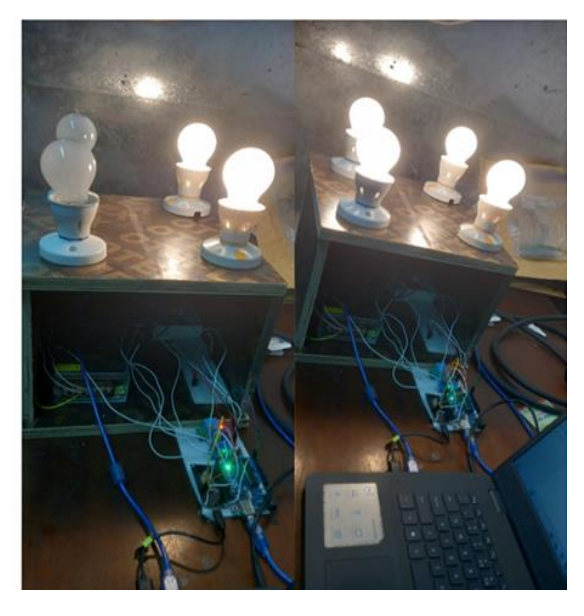
Figure 3 Implementation of the Proposed Model

The goal of the model is to identify the relationship between the input variables and the output variable and use that relationship to make decisions about the output variable (Begenova and Avdeenko, 2018).